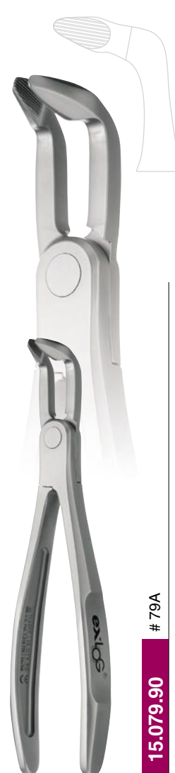
# 79A 15.079.90