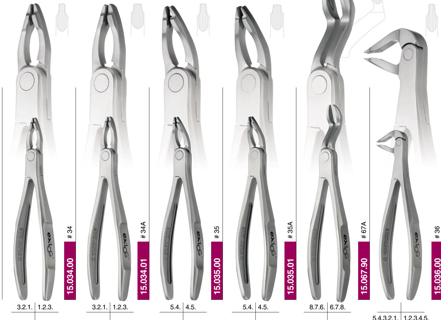
3.2.1. | 1.2.3.

The EX-LOG forceps offer an excellent anatomic fit and only need enough pressure so they do not slip out of the hand. The forceps guarantee a balanced axial luxation, better periodontal fibre dilatibility and increased sense of touch. They reduce traumata of surrounding tissue. The assimilated handles allow an individual and equal power transmission for left- and right-handed surgeons during pressing, pulling and turning movements. Because of the smooth handle areas and the demountability the EX-LOG forceps can be cleaned extremely well. So there are no hygiene critical areas any more like they are known from forceps with conventional lock. Especially with automatic conditioning in a wash tray the demountability is a great advantage because they need less space.